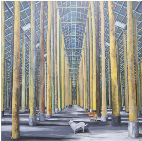
• The Stick Shed.

For more information closer to the date, visit the website at milduraartscentre.com.au .