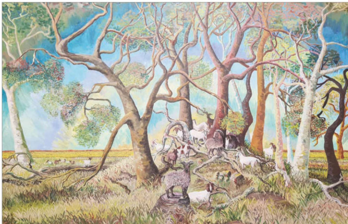
• Billy Goat Hill.